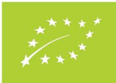
EU Organic label logo 2